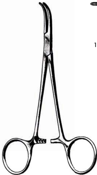
1/1 D 427 470