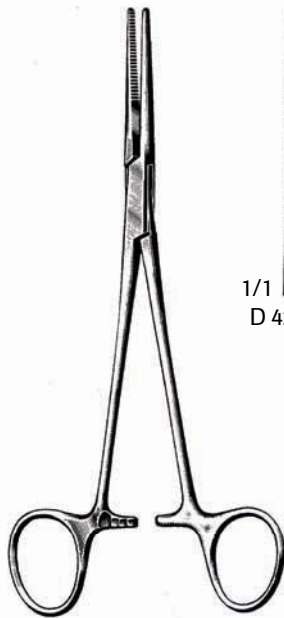
1/1 D 423 860