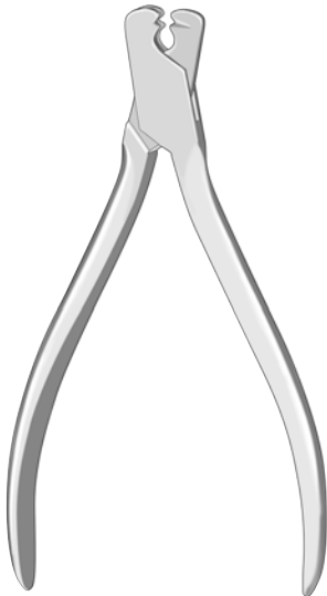
K-Wire Bender D 559 920 5-1/2" 3 Prong Bends up to 1.6mm (.062") K-Wire to 90° angle