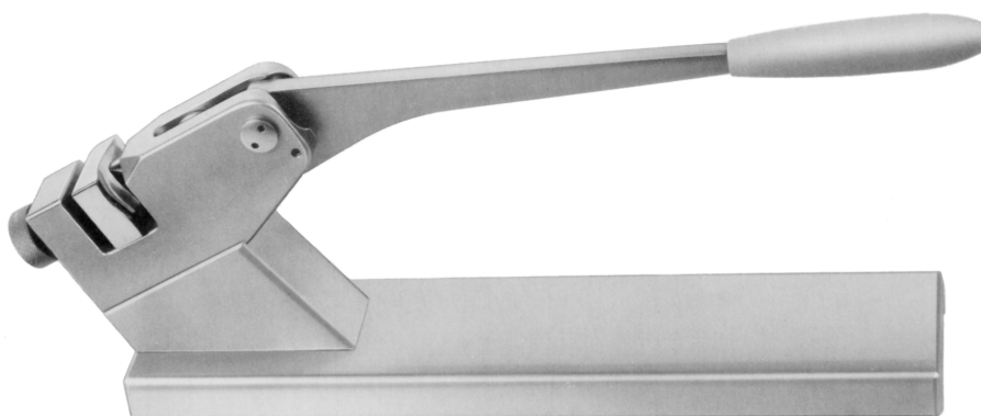
Plate Bending Press