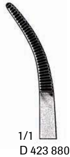
1/1 D 423 880