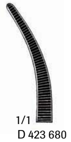
1/1 D 423 680