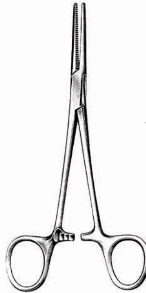
1/1 D 423 660