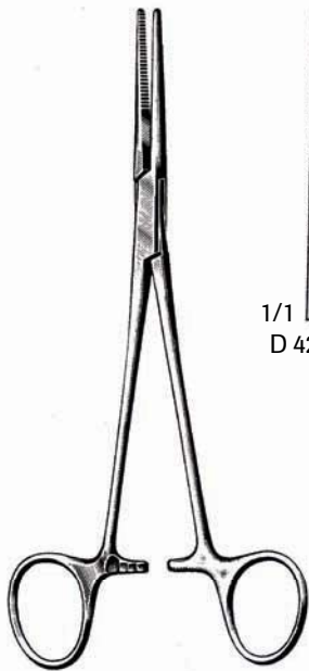
1/1 D 423 860